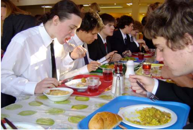
Eating in the school cafeteria