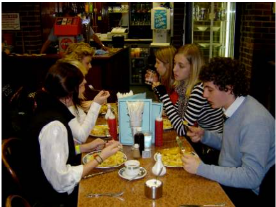
Eating out with partners