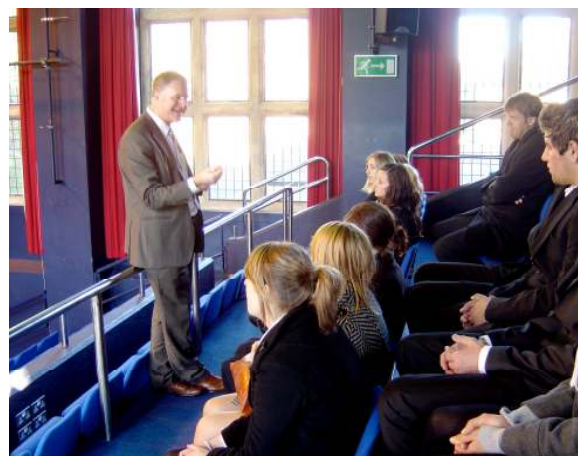
Going to the theatre