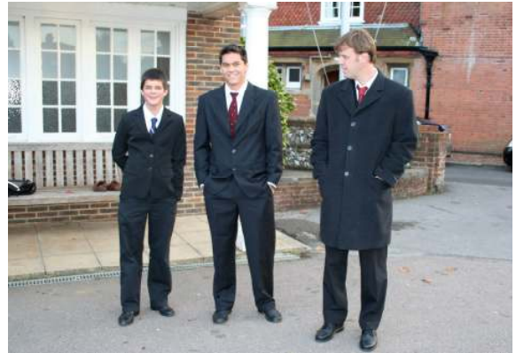
Wearing smart clothes