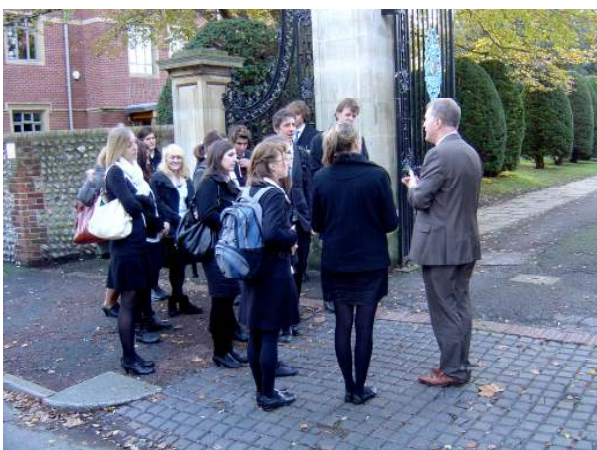
Tour of the college